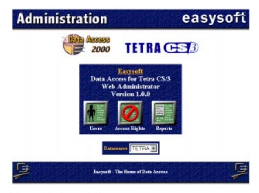
Figure 2: The Web Administrator main screen

4. On your server or on a client machine, run a web browser and go to http://server: 8450 where server is the name or IP address of the machine on which the Easysoft SQI-Sage Tetra CS/3 Driver is installed and 8450 is the Web Administrator port: