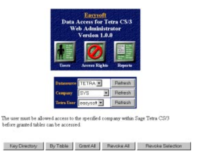
Figure 4: The Web Administrator Table Access Setup screen

4. To grant access to tables according to their key directory, click Key Directory .